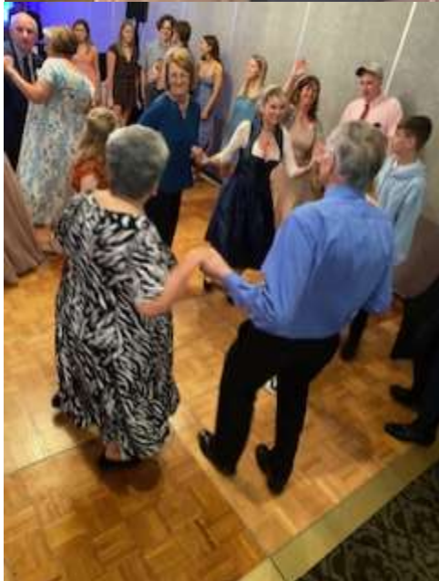
(Left to right / Bottom)